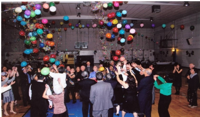
NDC's New Years Eve partiers ringing in the 2011 year! (No photo space in January Tomodachi so printing it here)

to eliminate any guess-work of dances to follow. This is a unique method. For the 73 attending the winter social and all other socials, it seems that this facilitates the flow so well, especially, for anticipating favorite dances. The Management Committee welcomes you to attend the February 26th social. The article for this social will appear in the next newsletter edition.