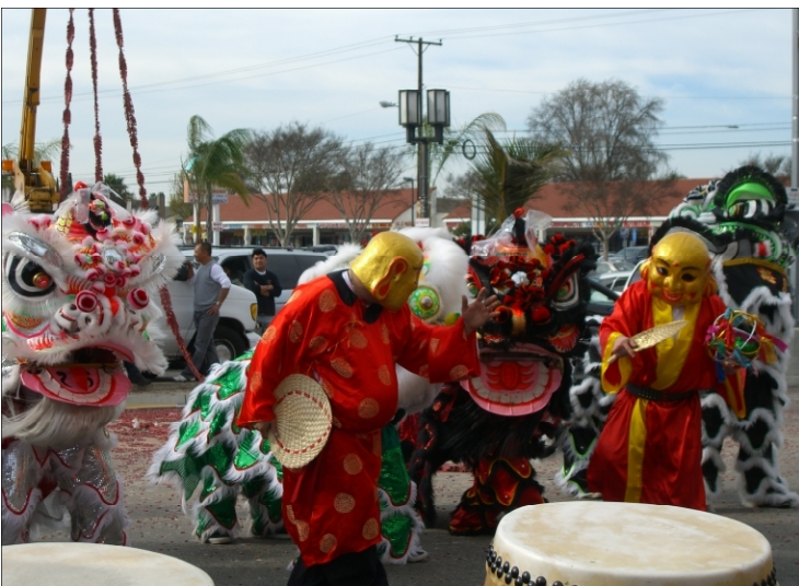
Chinese New Year's celebration in Westminster.