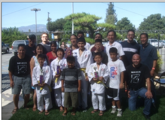
Norwalk students, parents and senseis at Nanka Novice Tournament.