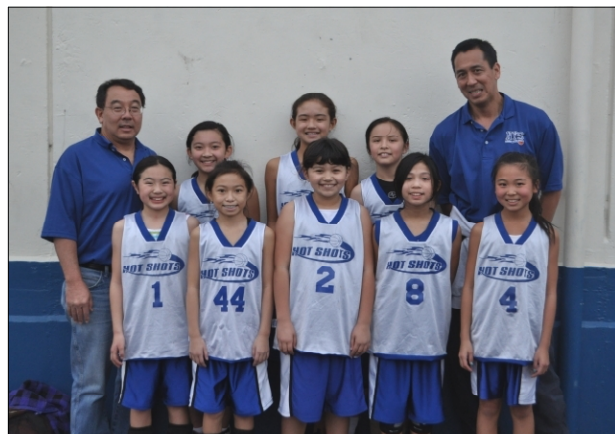
Hot Shots continue to play hard.

Good luck to our senior teams. We'll let everyone know next issue how our junior teams did this season.