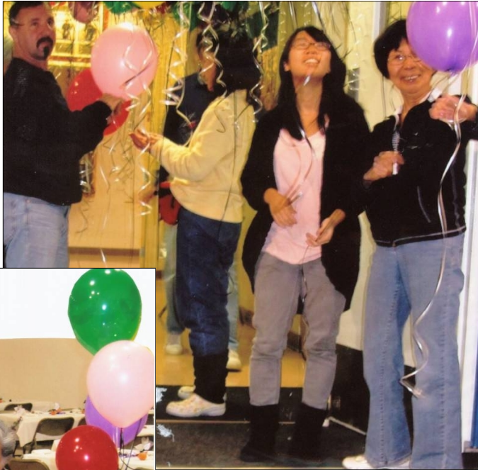
NDC group and friends having fun decorating gym for New Years Eve Dinner Dance.