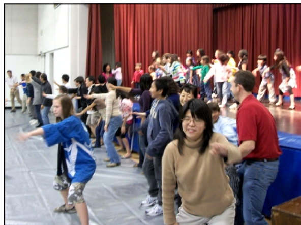
Everyone enjoyed dancing the "Sorani Bushi" at Gakuen's New Years Party.