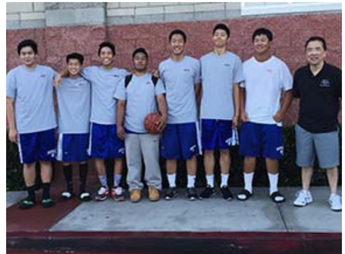
The 12th Grade Boys NYS Thunder celebrated their final VFW tournament by placing 2nd place in their division.